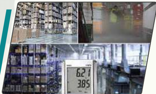
WAREHOUSE TEMPERATURE/RH MAPPING