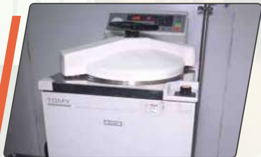
AUTO CLAVE VALIDATION

Validation and Monitoring equipment (Wired & Wireless) are major responsibilities that come under thermal validation. Well-maintained and calibrated equipment ensures that it operates at peak performance and complies with regulatory requirements.