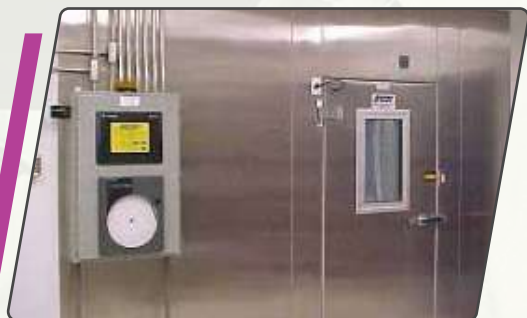
STABILITY CHAMBER TEMPERATURE/RH MAPPING