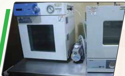
INCUBATOR/ OVEN TEMPERATURE MAPPING

We are specialises in the qualification of the following equipment: